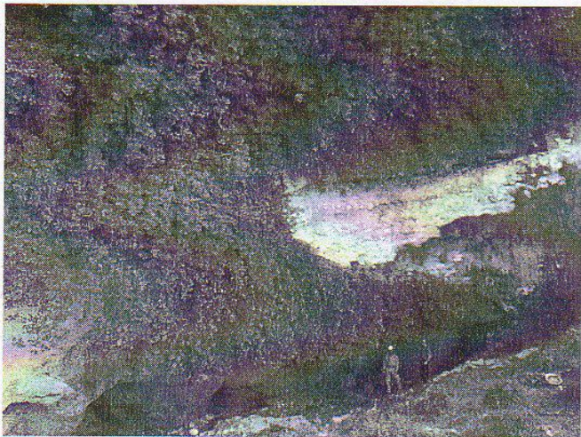
Site 1033 November Fiestas Dig

I won't mention the weather, I don't want to add insult to injury.