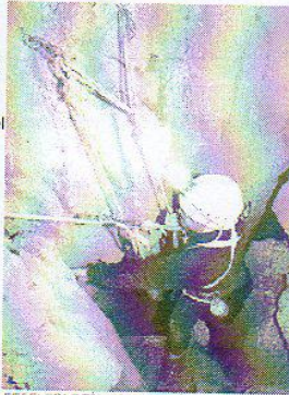
ESPELEOLOGIA. Un espeleólogo en una cueva cántabra.

En la operación de rescate, además de un técnico en explosivos, han participado el equipo de espeleosocorro del Gobierno de Cantabria, la Agrupación de Voluntarios de Protección Civil de Colindres, el GREIM de Potes y la Guardia Civil de Ramales y Arredondo, informó el Gobierno regional.