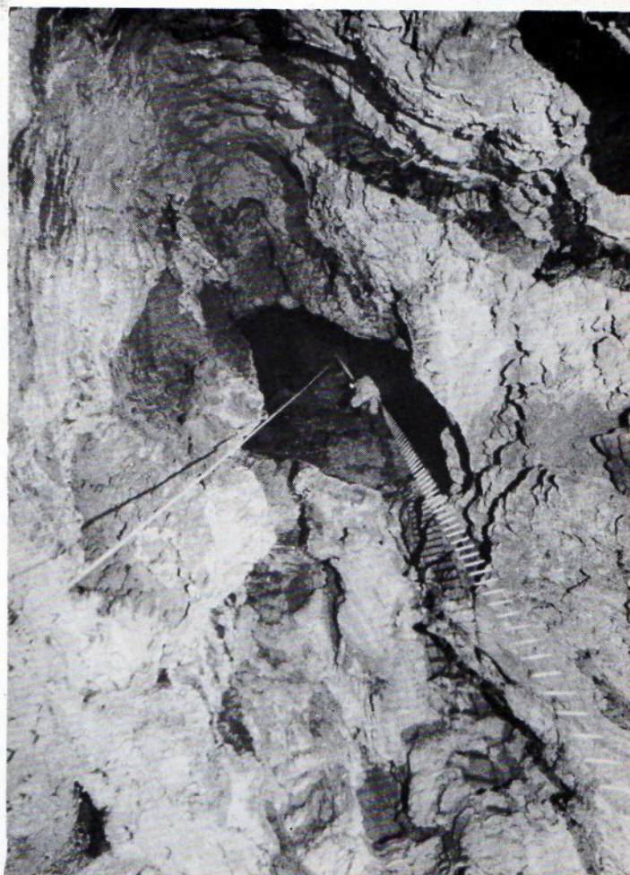
The 34m "Golden Void", entry pitch to this years extensions in Mostajo