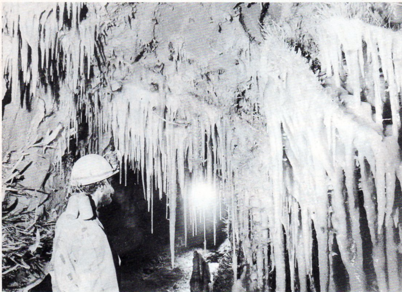
One of the many grottos in the lower series of Mostajo