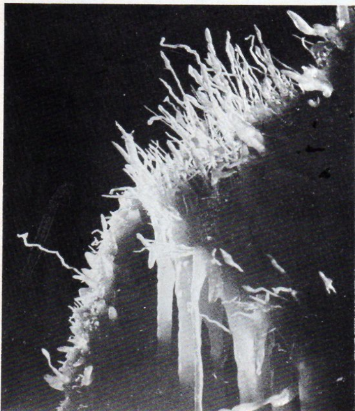
Helictites from Mostajo

A large party of cavers from various clubs returned, yet again, to continue exploring the caves in and around the Matienzo depression. The total of new passage discovered was nearly 6km, mainly in one system.